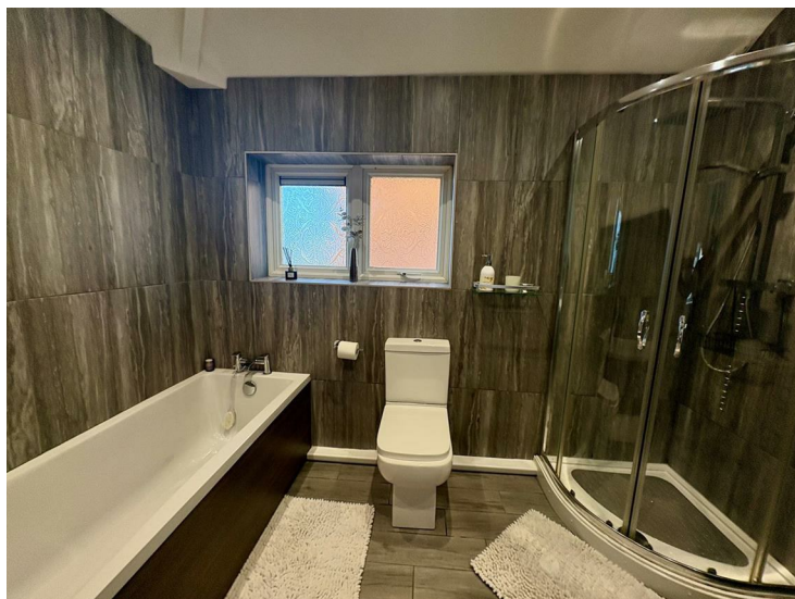
A stylish and contemporary bathroom featuring tiled flooring and fully tiled walls, complemented by a chrome heated towel rail. The suite includes a hand wash basin set within a vanity unit with mirror over, a wall-mounted vanity unit, panel bath, W.C., a corner shower enclosure and an obscure window to the side elevation.