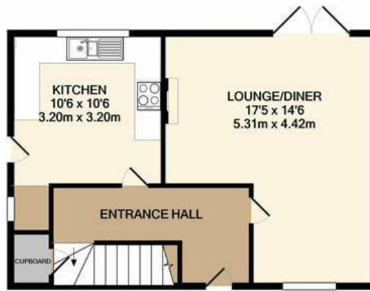
GROUND FLOOR APPROX. FLOOR AREA 498 SQ.FT. (46.2 SQ.M.)