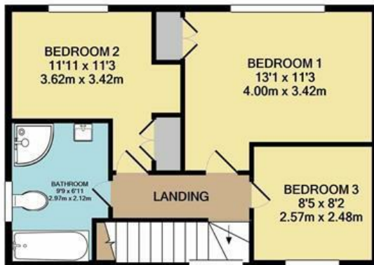
1ST FLOOR APPROX. FLOOR AREA 436 SQ.FT.